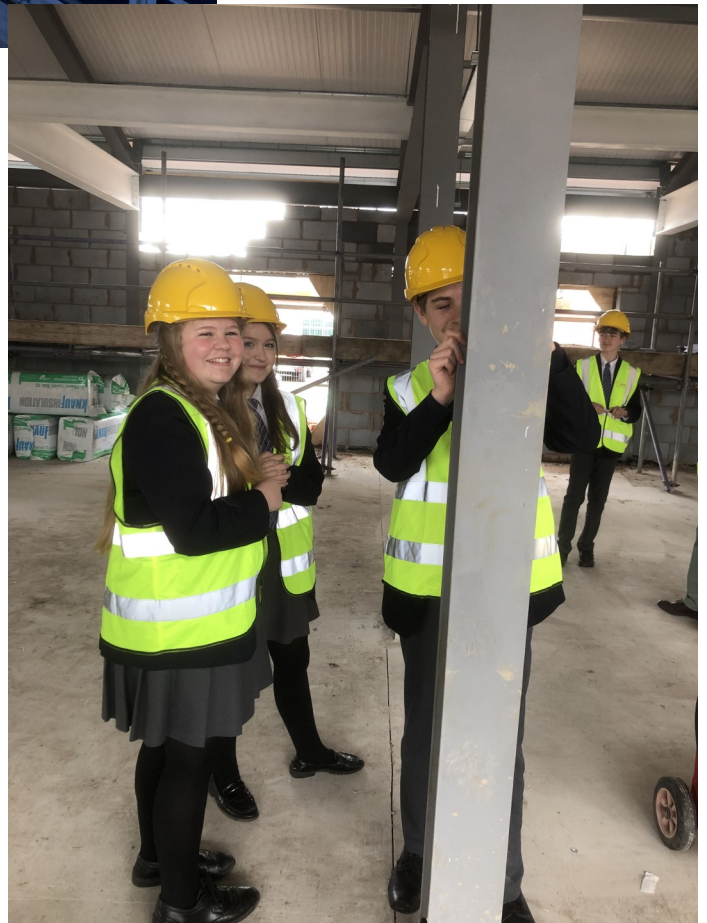
Students signing the steels on the new build.

Despite the snow and rain there has been much progress with the building of the new English Block extension.